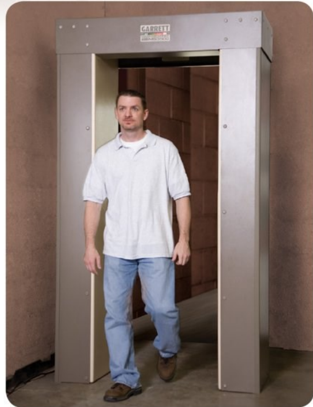
MS 3500™ Walk-Through Metal Detector